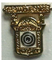
Distinguished Pistol Shot Small Fixed Pin $15