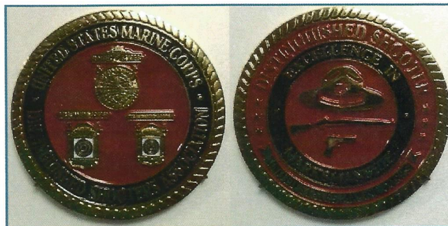
Challenge Coins $10