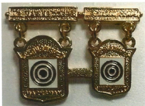
Double Distinguished Hanging Bar Pin $30