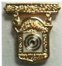
Distinguished Marksman Small Fixed Pin $15

Some of the ways you can show your pride of membership in the MCDSA are through the purchase of authorized challenge coins, distinguished pins, decals, shirts and pens. A few of these items are described below. They are available for purchase by contacting Dexter Conrad, 540-455-9047, dexcon45@gmail.com .