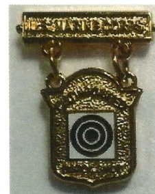
Distinguished Pistol Shot Hanging Pin $17