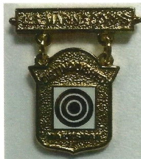
Distinguished Marksman Hanging Pin $17